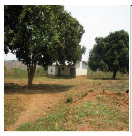
Figure: 8:Mangoes in Nhanguo

Most farmers have fruit trees on their homesteads, mainly mangoes, bananas, lemons, and oranges which are not grown on a commercial scale