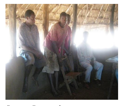
Figure: 5: Women and the Youths