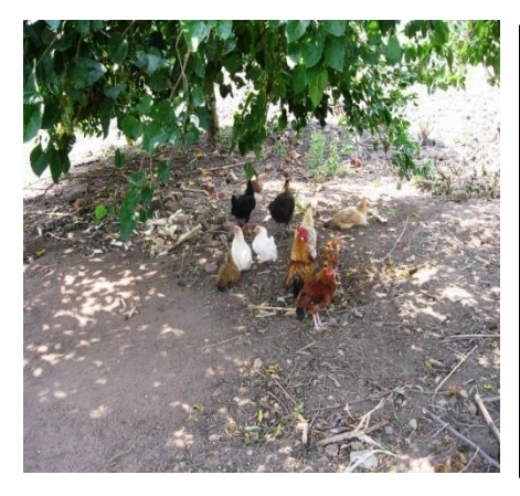
Figure: 3:Some Chickens

Some farmers keep poultry mainly turkeys, chickens and guinea fowls. The way these are raised could be improved and done on a more commercial basis to create more income for the owners