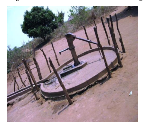
Figure: 11: Water source in Nhanguo