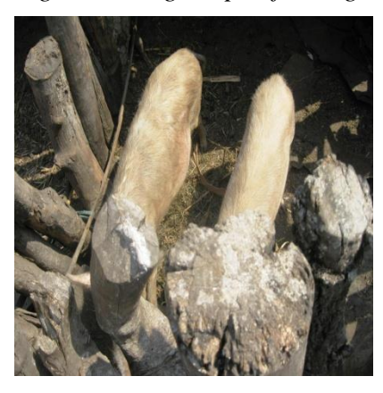
Figure: 7: Pigs in pen feeding