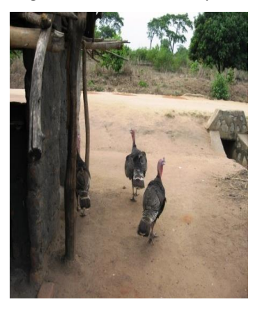
Figure: 4:Some Turkeys