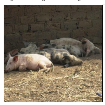
Figure: 6:Pigs in Nhanguo

The pigs in most rural communities Mozambique allowed to roam freely and they are where penned these pens built from basic materials leaving a lot of room for improvement