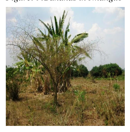
Figure: 9:Bananas in Nhanguo