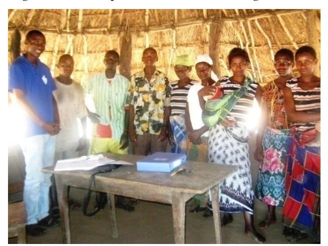
Figure: 2: Group discussion in Gorongosa