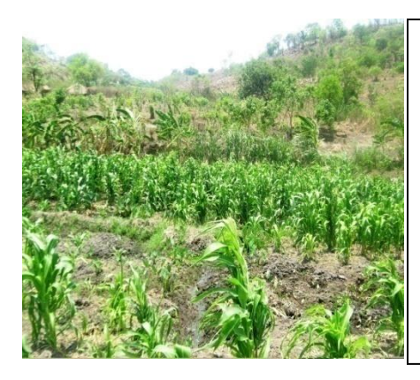
Figure: 10:Maize Fields in Nhanguo

Farmers were also able to identify the abundant land for farming and scarce water sources available